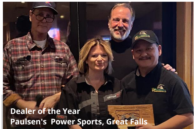
Dealer of the Year Paulsen's Power Sports, Great Falls