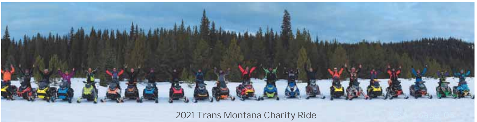
2021 Trans Montana Charity Ride